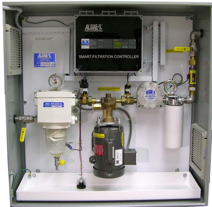
Inside view STS 6000-4GPM-SE1 (shown with optional Separ primary)

STS 6000 Accessories: AFC-705 Fuel Catalyst, Wide range of filter elements, Rotor Sight Glass, Foot Valve, Separ Primary Filter, Two tank control, Digital flow meter